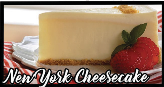
New York Cheesecake